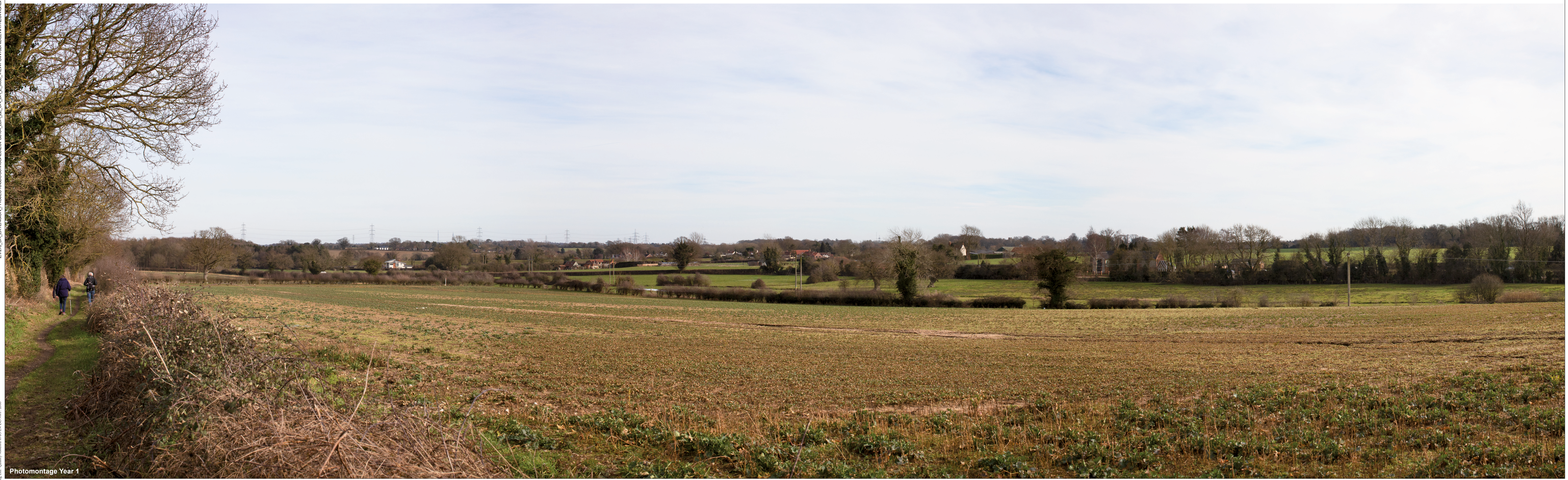
Photomontage Year 1

Z:\7273_UK_EXTENSION_PROJECTS\DOCS\VISUALISATION\LD_A_ZZ_ON_DR_Z_0059_VIEWPOINT\BRIDLEWAYKESWICKBR3.INDD